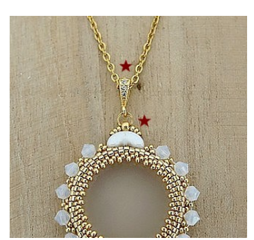
20) Place your bail and your chain. You have finished the « Castille » pendant!

Happy beading! Thank you for respecting my work ©