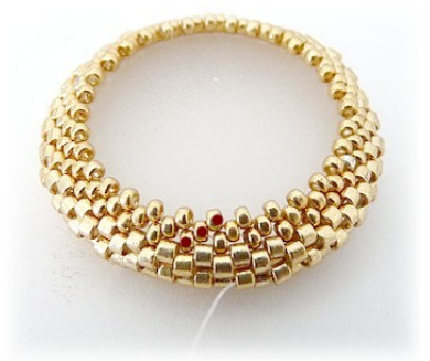
3) Bead 3 R15 rows, place your cabochon, pass through to the other side of the Peyote and bead 3 more R15 rows