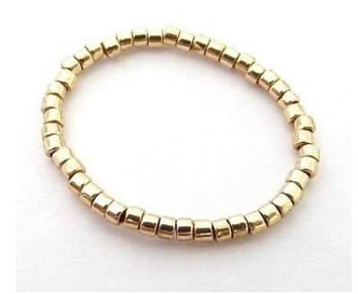
1) Pick up 64 DB11 and close