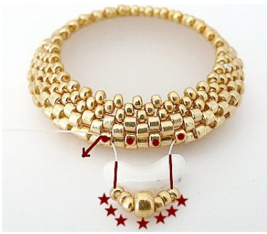
5) Pick up 1 Arcos, 3 R15, 1 R8, 3 R15 pass through