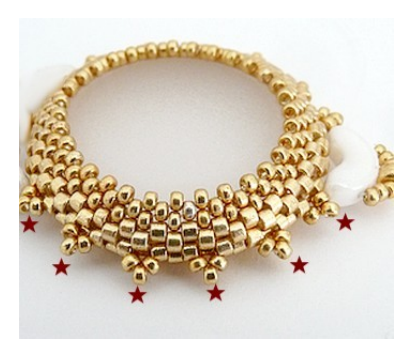
7) Repeat step 6, 5 more times, you'll have a total of 6 x 3R15