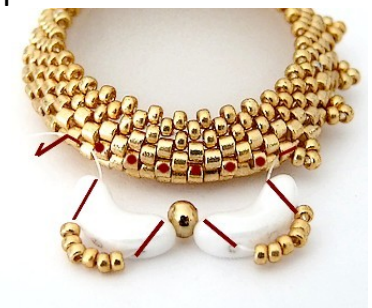
8) Pick up 1 Arcos, 6 R15, exit through Arcos, pick up 1 R8, 1 Arcos, 6 R15, exit through Arcos and