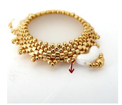
10) Exit like picture, in the central R15