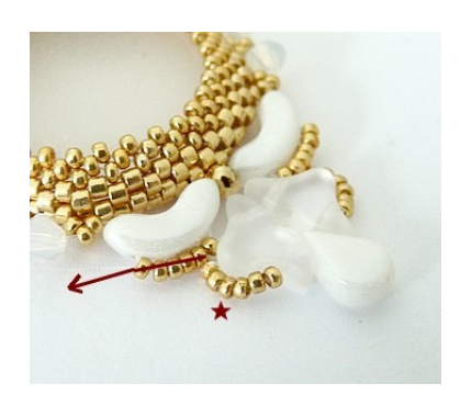
19) Pick up 6 R15 and pass through the following R15, you can close your work