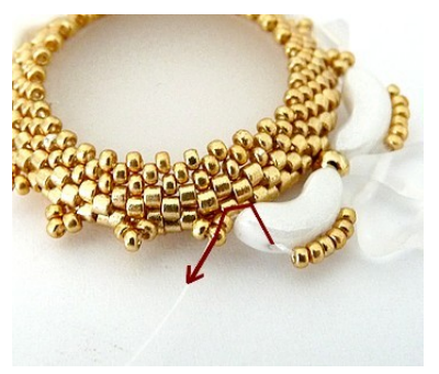
15) Pass through Arcos, exit through the central R15 and repeat step 12 for the other side