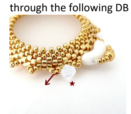
11) Pick up 1 T4 between each central R15