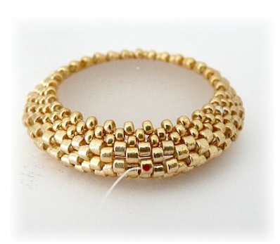
4) Exit like picture, 3rd DB11 row