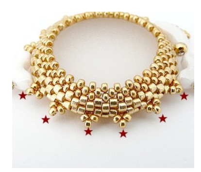
9) Repeat steps 6 and 7