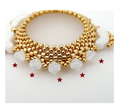
12) You'll now have this