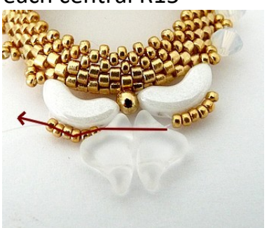
14) Pick up 2 Helios and exit like picture through the 6 R15