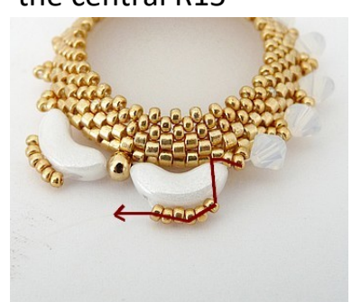
13) Exit like picture, through the 6 R15