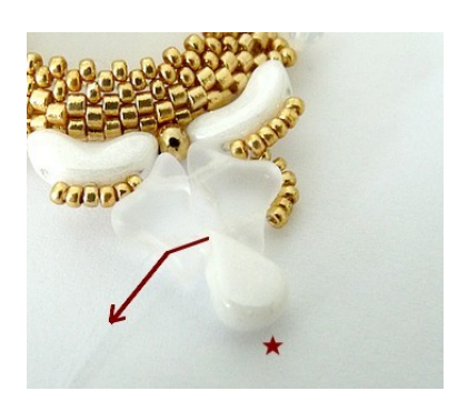
18) Pick up 1 Amos, exit through Helios