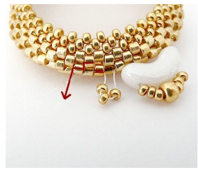
6) Pick up 3 R15 and exit like picture