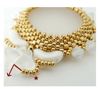
17) Pick up 6 R15, exit through Helios