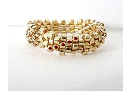
2) Bead a total of 5Peyote rows