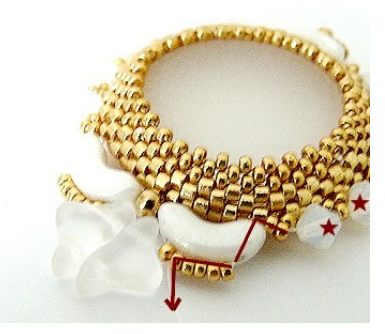
16) Pass through all the beads and exit through the 5th R15